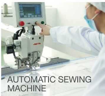
AUTOMATIC SEWING MACHINE