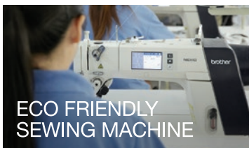
ECO FRIENDLY SEWING MACHINE