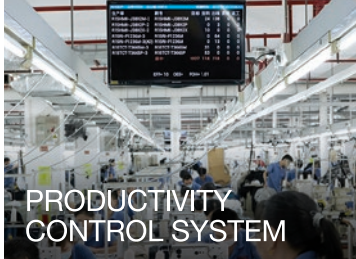
PRODUCTIVITY CONTROL SYSTEM